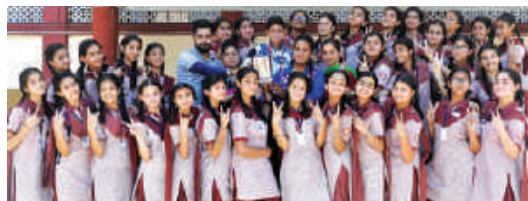
Khelo India- Best over all performance.