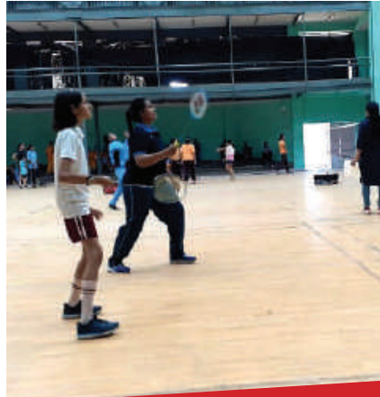
Inter School Badminton tournament held at M.A Stadium on 23 rd -24 th April. Bronze for Carmel