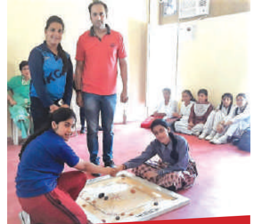
Inter School Carom Competition held at M.A Stadium on 23 rd -24 th April. School won Silver in single play off.