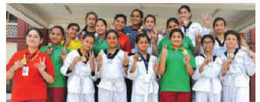
3 rd J&K State Hapkido Championship 2019 organised by Hapkido Association of J&K and hosted by Hapkido Federation of India. 12 girls bagged medals in the event.

Congratulations to everyone for their continued commitment and dedication.