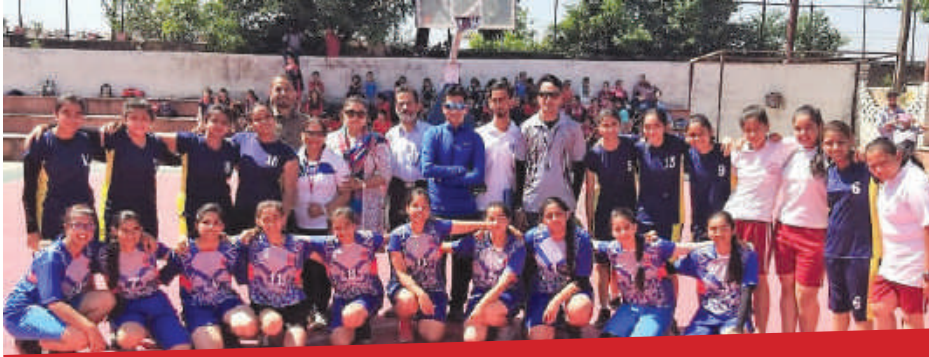
Carmelites at U-17 Basket Ball tournament held at M.A Stadium, Jammu on 13 th May.