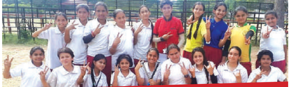
U-14 and U-17 Team in Inter School Softball Tournament held at Science College on 13 th May. Gold Medal for both teams.