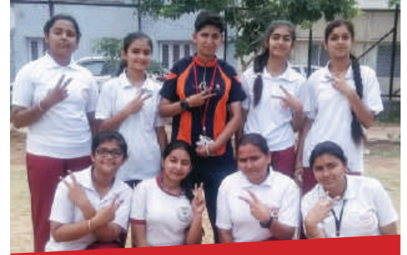
U-17 Inter School Netball Competition held at Dogra Ground, Gandhi Nagar Jammu on 23 rd May. Team won Gold