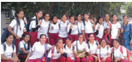
U-14 and U-17 Team in Inter School Kabaddi Tournament held at Green Field, Gandhi Nagar on 3 rd -4 th May. Gold for Carmel.