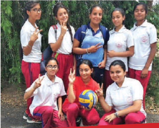
U-17 Inter School Volley Ball competition held at Dogra Ground on 3 rd -4 th May. Team won Silver Medal.