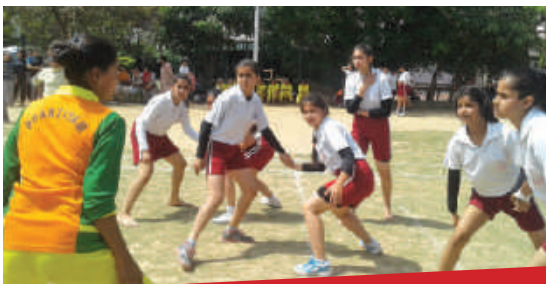
U-17 Inter School Kabaddi Tournament held at Green Field, Gandhi Nagar on 3 rd -4 th May. Gold for Carmel.